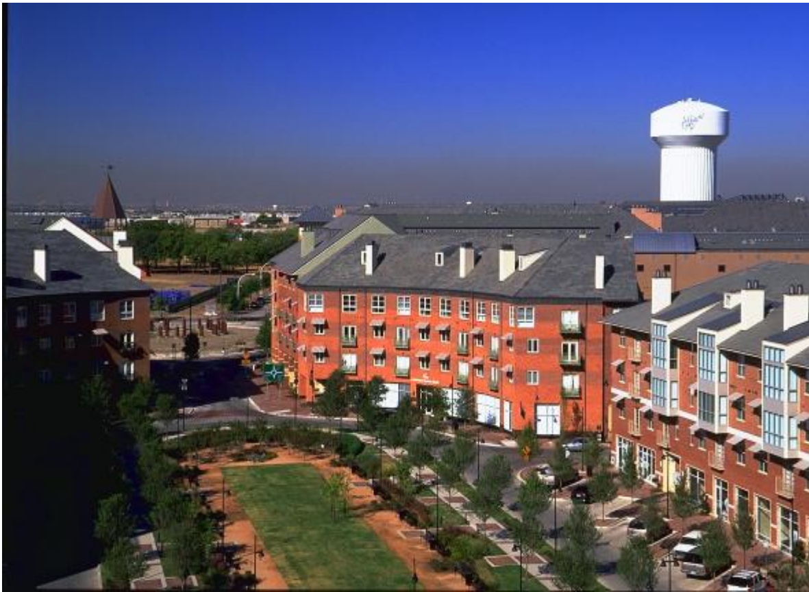
Addison Circle

Dallas-Fort Worth is an optimal place to conduct this study because of its relatively strong real estate economy. Additionally, the fact that the greatest number of New Urbanist Communities existing here means that more developers could possibly have greater understanding of these developments. Keeping my research within one greater statistical area allows for a controlled study that would otherwise require controls for multiple market conditions, consumer tastes, etc.