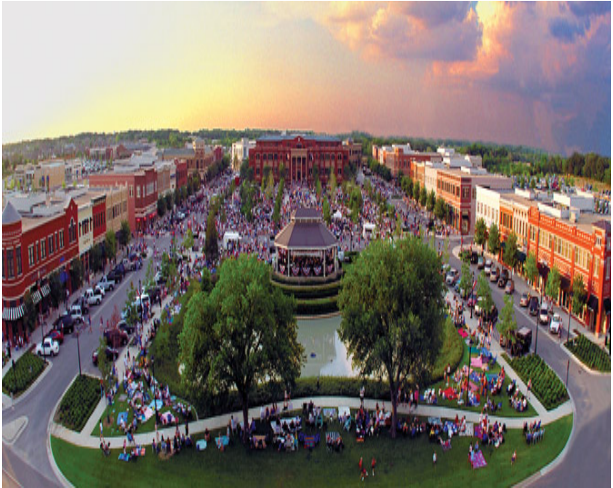
Southlake Town Square