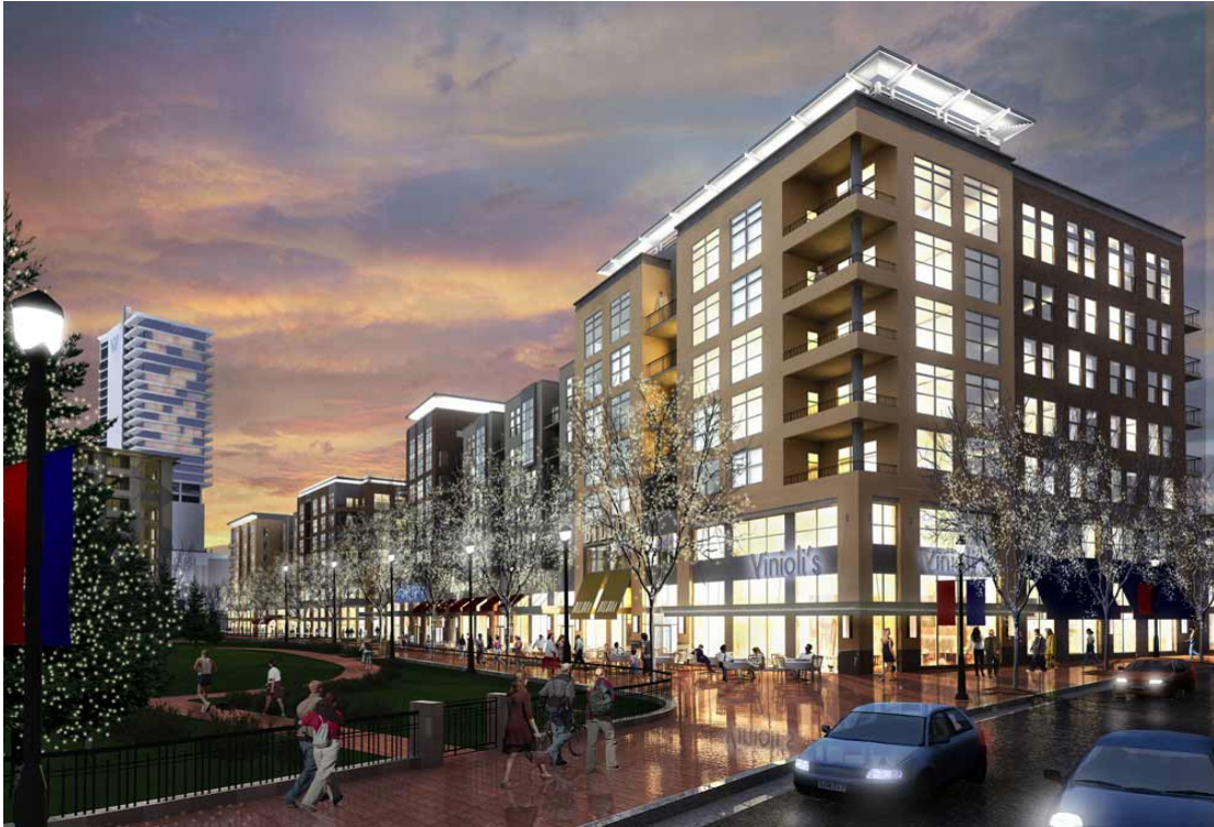
Victory Park in Dallas

against dense New Urbanist Communities, the public's possible lack of demand for these communities, or developers potential favor of traditional developments such as the subdivisions dominant in Arlington, TX and Mansfield, TX.