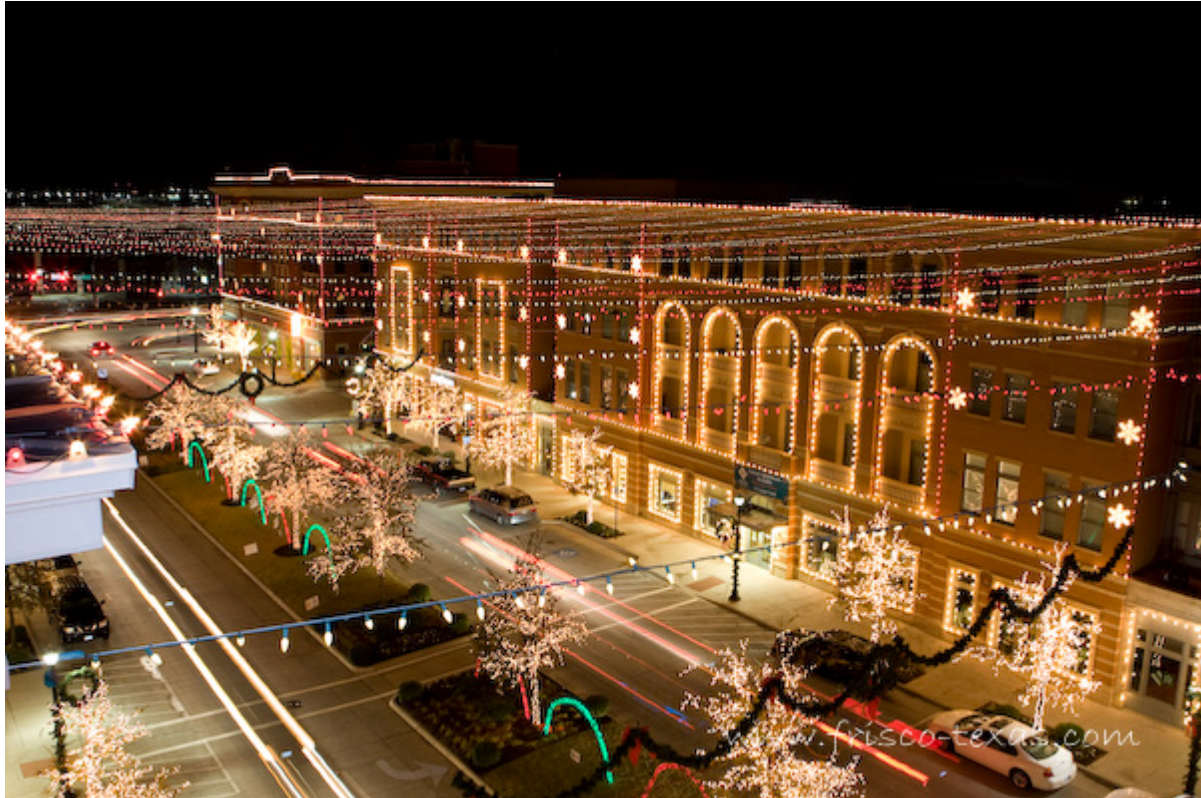
Frisco Square