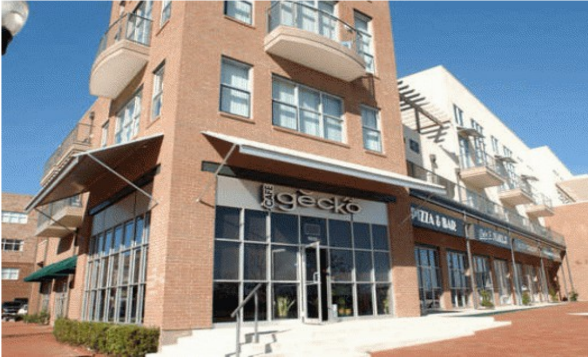
Austin Ranch in The Colony