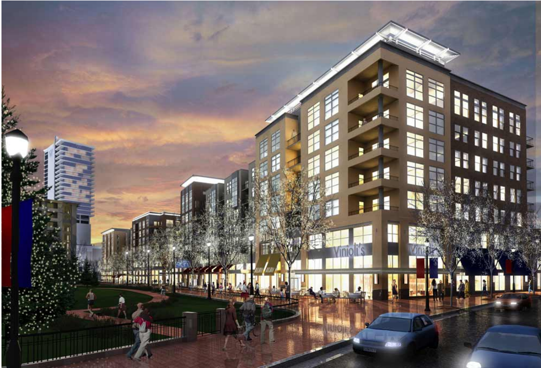
Figure 1. Victory Park in Dallas

I hypothesize that developers do recognize that demand exists to build more New Urbanist Communities, but that they do not build more because of the poor housing market, and due to the local building regulations which discourage these communities. This hypothesis is based upon weak real estate sales numbers (Realtors, 2011) and historically unfriendly zoning regulations (Levine, 2006).