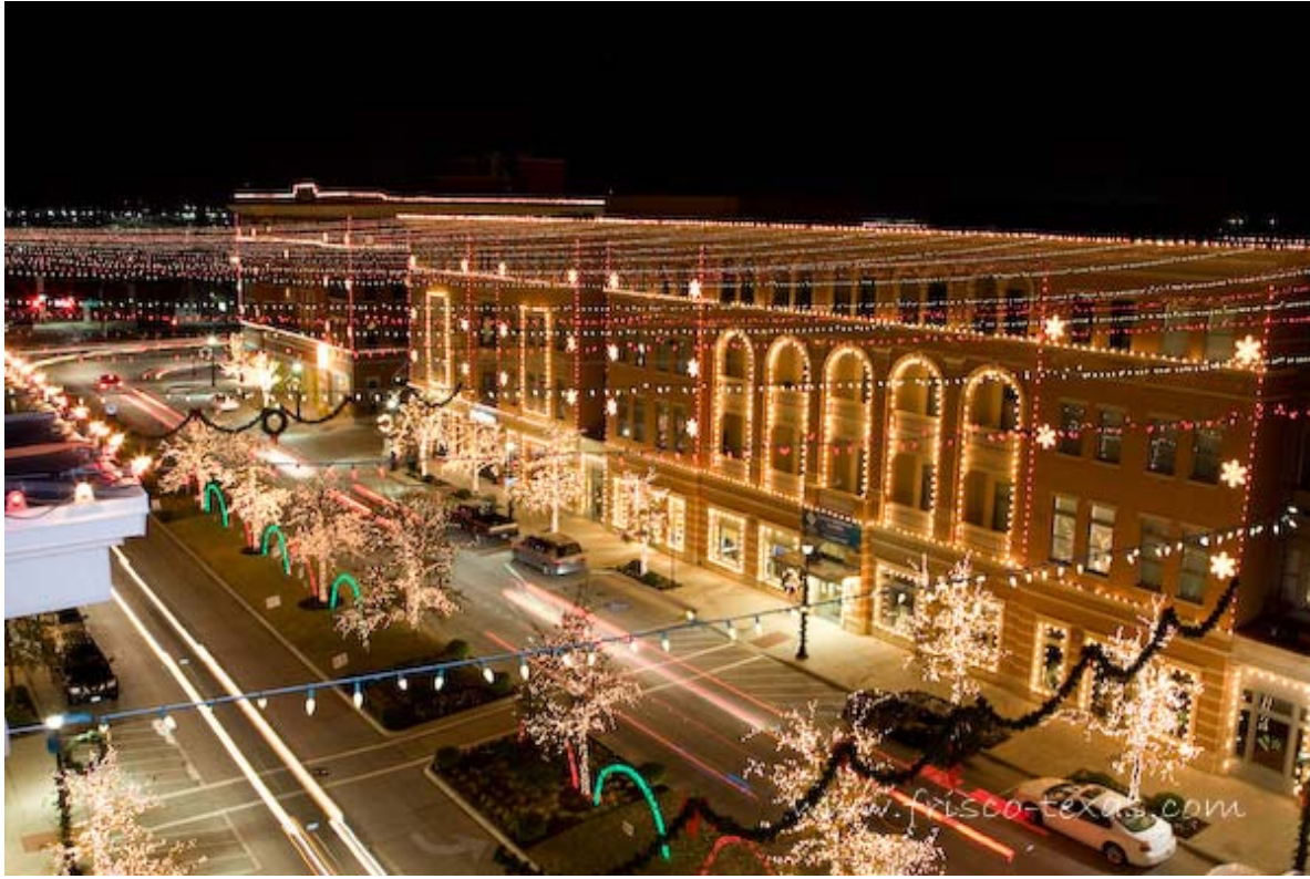
Figure 5. Frisco Square