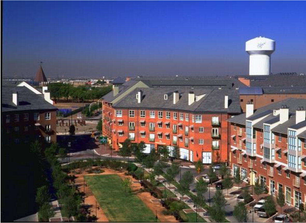
Figure 3. Addison Circle