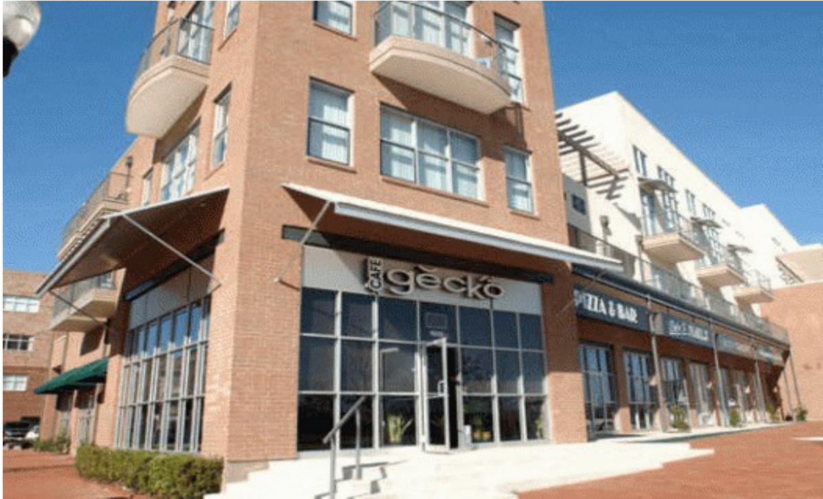
Figure 6. Austin Ranch in The Colony from www.yourrentwesplit.com