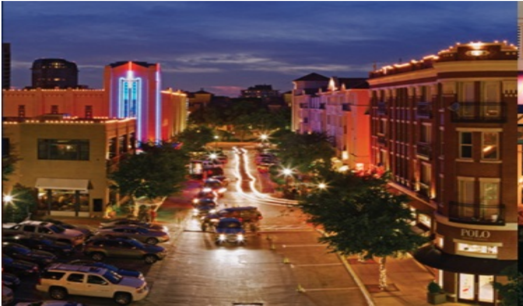
Figure 2. West Village, Dallas

and Greater San Antonio had two New Urbanist Communities within its 2.14 million population.