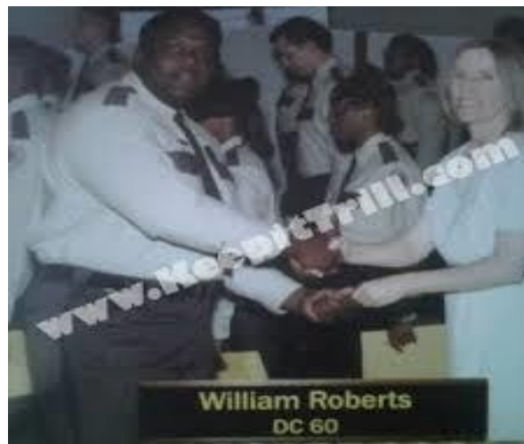
Fig. 3. “Rick Ross was a Cop.” Kastnfameprod . Wordpress, 25 Sept. 2008. Web. 15 April 2013.