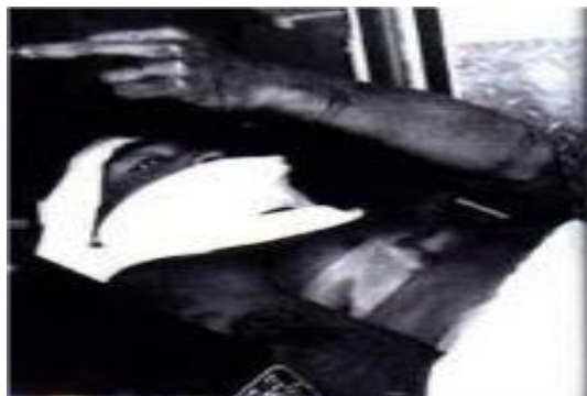
Fig. 1. “2Pac’s 1994 New York Shooting.” 1994. Photograph. 2Pac World . Web. 26 Dec. 2013.

Despite how Tupac Shakur releases his first album before being shot five times, he was on trial for a sex-abuse charge when he was robbed of his jewelry and shot at a recording studio later in his career. (“2Pac Biography). He became famous for his expression after his shooting, shown in the photograph of Shakur on an ambulance stretcher (Fig. 1). I am not glorifying this type of lifestyle, but I am conveying how performance was an ethos appeal for Shakur. This picture represents a successful ethos appeal to his audience because he is the same vocal and controversial rapper even when he is wounded. His shooting highlights the beginning of a rap career where a rapper’s lyrics are not for entertainment or profit, but are rather non-fiction and auto-biographical raps.