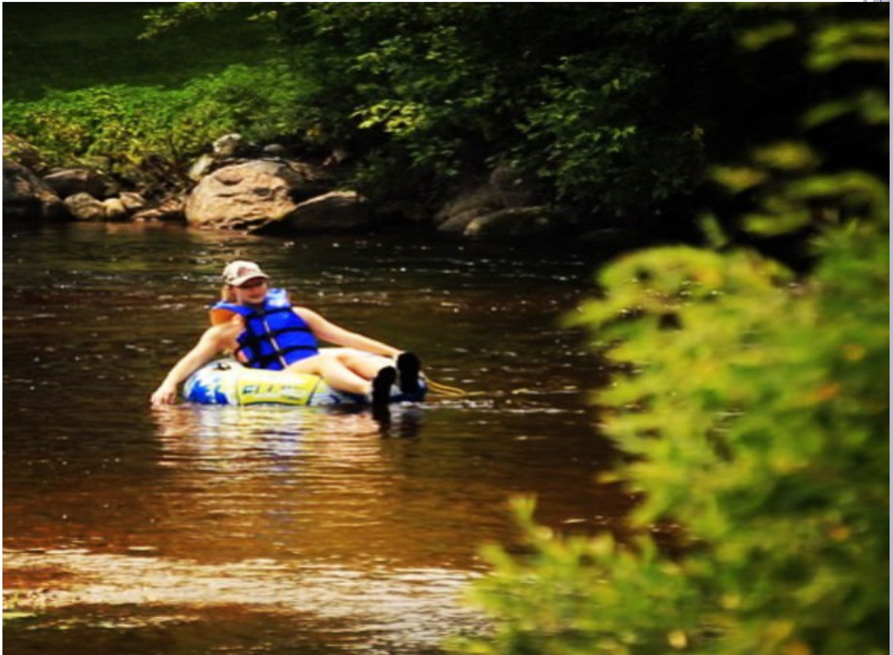
https://flic.kr/p/vtm4vp - Happy Canada Day by Omega Man