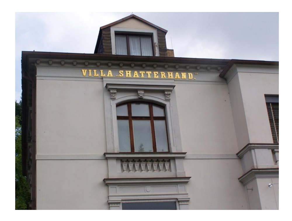
Figure 3.3 Villa Shatterhand.