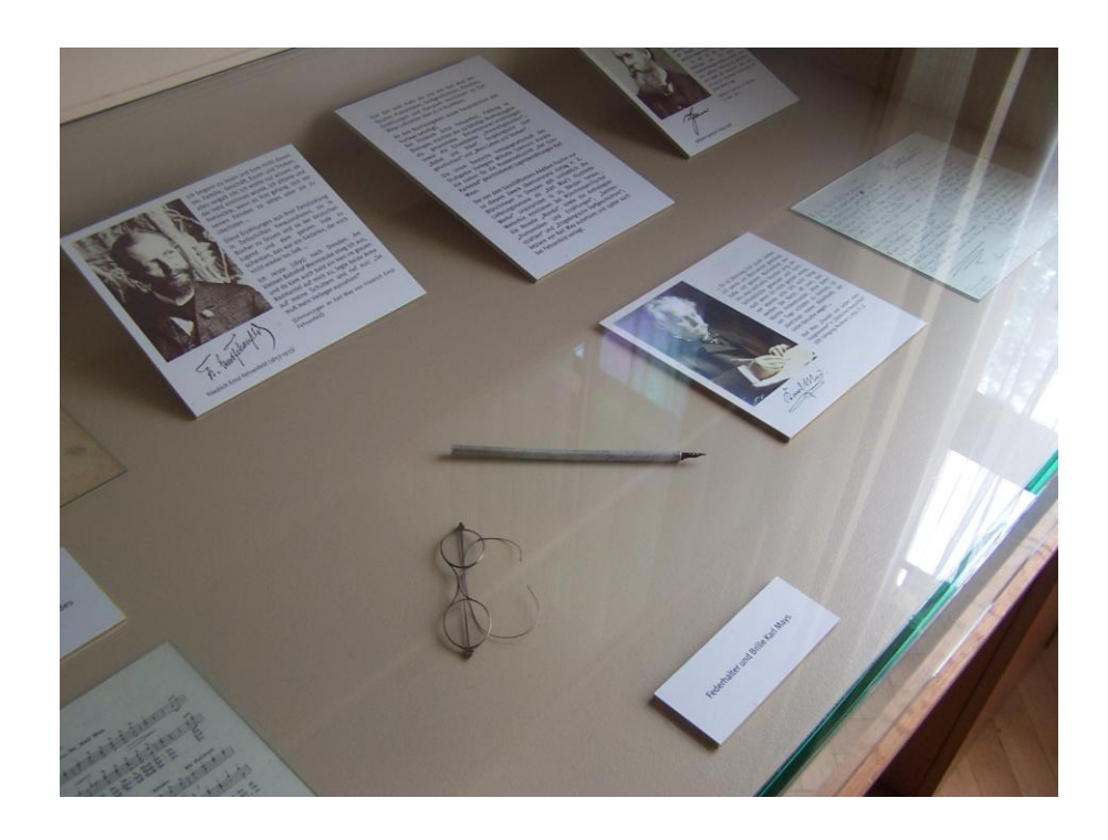
Figure 3.6 Karl May's desk.

his works had been favored by Adolf Hitler, Karl May's works could only be published in West Germany after the war.<sup>52</sup>