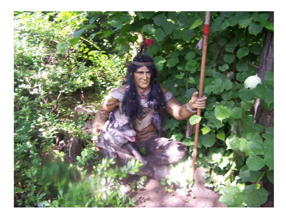
Figure 3.7 A statue of a sitting Indian in the small park at the site of the Karl May Museum.

Four films based on Karl May's novels about adventures in the Middle East had already been made before World War II. The first three, Auf den Truemmern des Paradises, Bei den Teufelsanbeten , and Die Todeskarawane were filmed in the 1920s. The fourth one, Durch die Wueste , was the first Karl May film with sound, produced in the 1930s. Neither of them, however, concerned the American West, which might explain why they failed to attract large audiences. Only in the early 1960s did West German filmmakers tackle May's successful novels of the American West. Given the amount of action and the vivid narrative of his novels, it must have been problematic for directors and film producers to write a script, let alone secure financing for creating the set-up for Karl May's Wild West. Moreover, a cinematic interpretation of Karl May's novels required directors and producers to agree to delete certain parts, alter others, and yet to