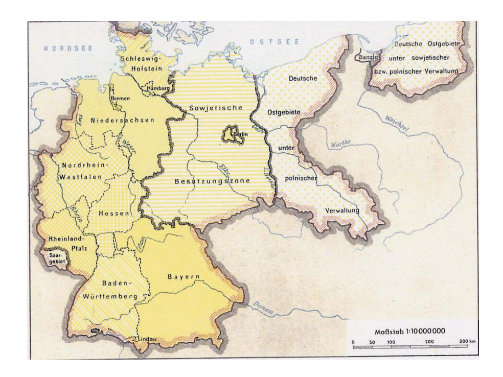
Figure 2.3 Soviet Zones of Occupation.

to use the border of 1937 to represent Germany's eastern border, however West Germany's Supreme Court ruled in 1973 that not only was West Germany the only true representative of Germany, but that the German Empire continued to exist as a legal entity. The Oder-Neisse boundary was only recognized in November 1990, shortly after the reunification of Germany.<sup>14</sup> Whereas on West German maps West Germany was divided into proper German Lands, East Germany was labeled as "The Soviet Zone of Occupation," and Silesia and Eastern Prussia were labeled as "German Eastern Territories under Polish and Soviet Administration."