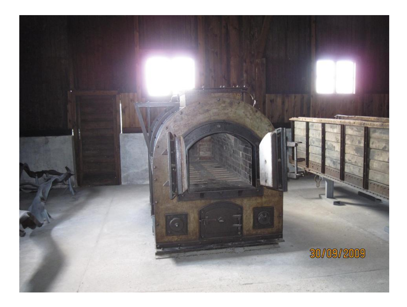
Figure 7.1 A cremation oven at the former Majdanek concentration camp.

In the immediate aftermath of World War II, German filmmakers produced only a few films that dealt with the legacy of National Socialism. Soon after the war, Germans began to perceive themselves the first victims of Hitler. More and more war stories began to circulate that emphasized fighting, imprisonment, evacuation, expulsion, loss, and rape. Furthermore, by excluding the Wehrmacht from a list of criminal organizations, many Germans accepted the myth that German soldiers did not commit war crimes. Rather, Germans stood behind their soldiers and, unwilling to acknowledge the atrocities