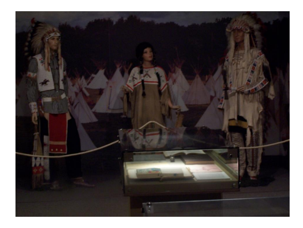
Figure 3.4 Inside Villa Bear Fat.