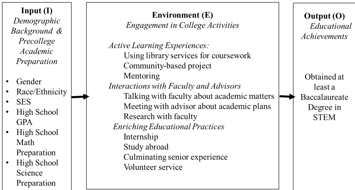
Figure 2. A conceptual model of community college transfer student's baccalaureate degree attainment in STEM

used, sample, variables, data management, and analytical procedure. Delimitations and limitations are also addressed.