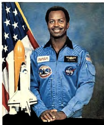
Dr. Ronald E. McNair Scientist & Astronaut, 1950–1986

programs. UT Arlington McNair graduates have subsequently earned masters and doctorates not only from their alma mater, but also from an impressive array of universities including Harvard, Indiana, Rice, and Southern Methodist, among others.