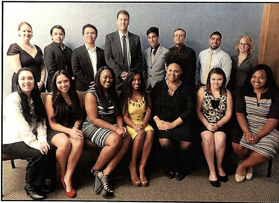
2015 Summer Research Banquet