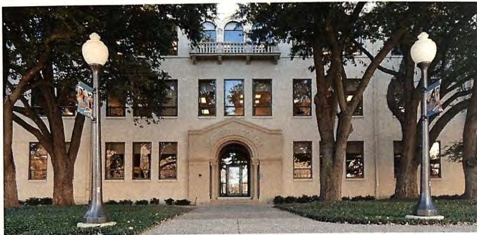
Ransom Hall, location of the UTA McNair Scholars Program

The Ronald E. McNair Postbaccalaureate Achievement Program is a federally-funded TRiO program.