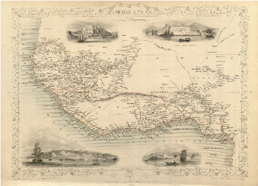
John Rapkin, Western Africa , from Montgomery Martin, The Illustrated Atlas and Modern History of the World , 1850.

The University of Texas at Arlington Libraries is pleased to announce five research grants for K-12 teachers to conduct research in UTA Libraries Special Collections during the summer of 2019 in order to create new course content in their school or district utilizing Special Collections African-American primary source materials