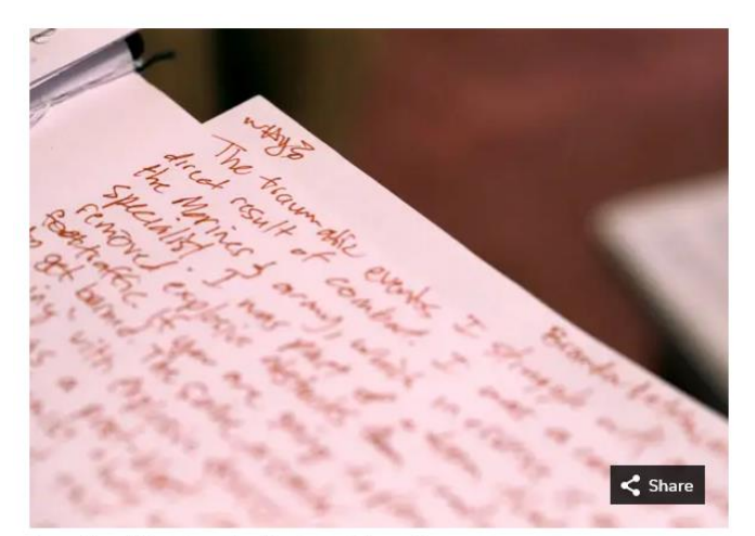
A portion of Sgt. Brandon Ketchum's journal.