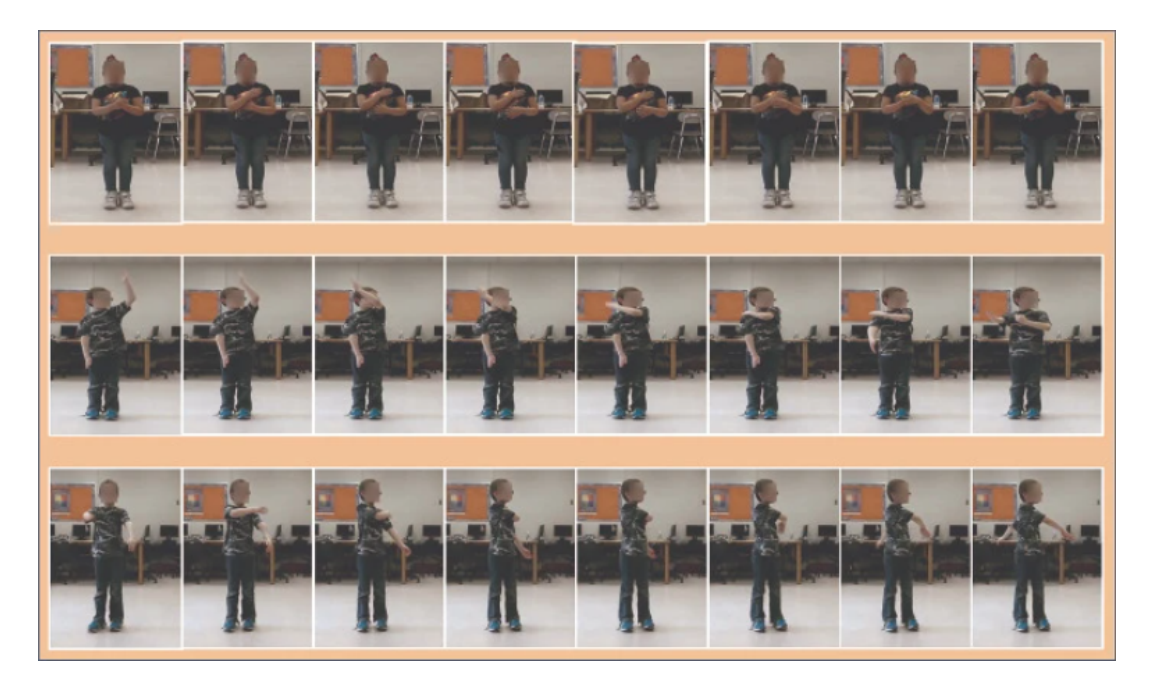
Figure 2: Sample image frames from the Cross Your Body (CYB) Task. The actions (top to bottom) performed are "right hand left shoulder", "left hand right shoulder", and "right hand left shoulder", illustrating the level of variations that the touching-shoulder action can have [22].