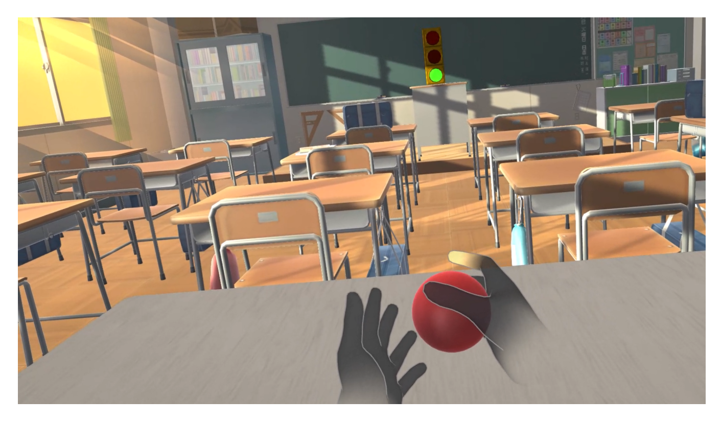
Figure 5: Demo of the VR Environment where a user performs the PBB task, passing the ball from one hand to another during a GREEN light.