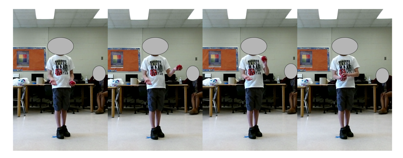
Figure 1: Sample image frames from the Pass the Ball to the Beat (PBB) Task. Here, the child performs a "PASS" action when the GREEN light turns ON or when they hear the keywords "GREEN LIGHT".

SmartFunction: An Immersive Vr System To Assess Attention Using Embodied Cognition