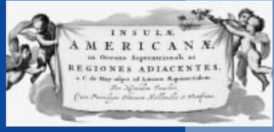
Cartouche, Insulae Americanae in Oceano Septentrionali