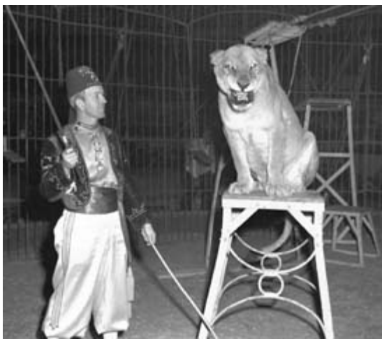
The circus comes to Fort Worth, n.d.

From the W. D. Smith, Inc. Commercial Photography Collection.