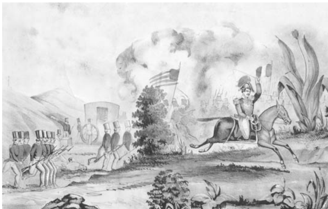
"Flight of Santa Anna from the Battle of Cerro Gordo," (Philadelphia: R. McGee, ca.1848).