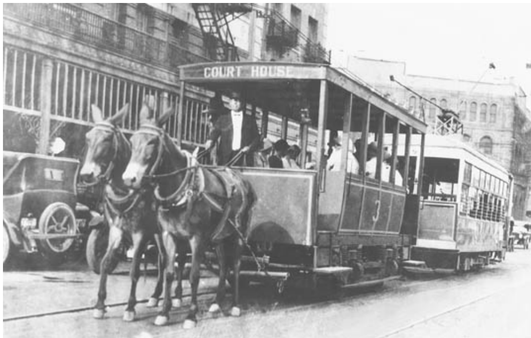
Mule-drawn and electric trolleys traversing a downtown Fort Worth street.

A print copy of the Guide does not yet exist except for a reference copy in the division, but for those with access to the Internet, downloading our virtual guide and making a copy is a virtual cinch. Needless to say, we are very happy to have this document completed for the convenience of our researchers and the staff. The Web format allows it to be a fluid document and grow with the division's acquisitions throughout the twenty-first century. With the completion of this guide, we hope that researchers will be better able to determine if we have collections that both interest them and satisfy their information needs.