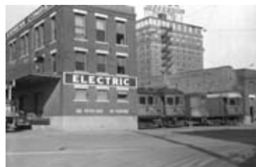
Class A freight motor 800 (left) rests between runs by the Dallas freight house, while box motors (right) wait