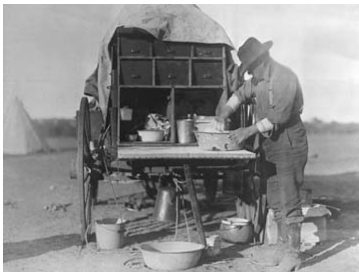
Making biscuits on the plains, n.d.

From the W. D. Smith, Inc. Commercial Photograph Collection.