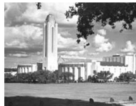
Will Rogers Center, Fort Worth, n.d.