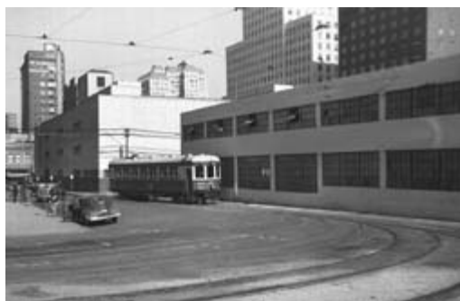
The 327 about to enter the Dallas Interurban Terminal in Dallas, February 15, 1946.