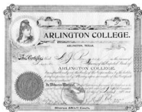
Arlington College Stock Certificate, 1900, from the UTA Archives.