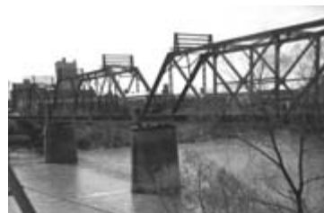
The 253 crosses the Brazos River in Waco on its way to Dallas, March, 1946.