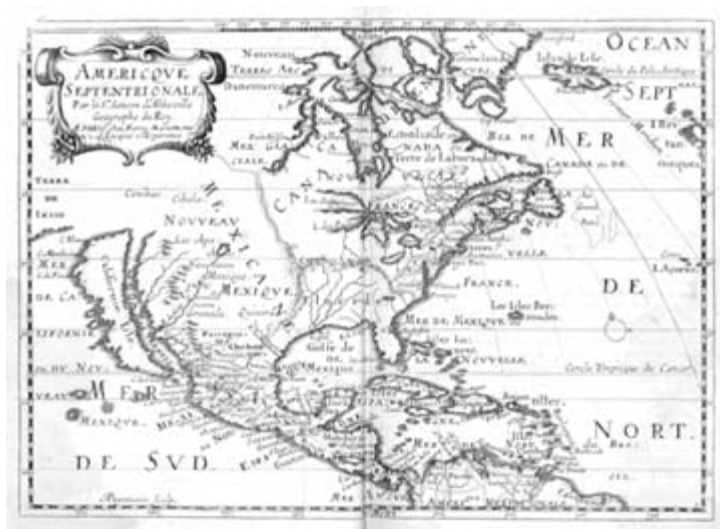
"Amerique Septentrionale" in Nichol Sanson d'Abbeville, L'Amerique en plusieurs cartes, et en divers traités de géographie et d'histoire.... Published in Paris by N. Sanson d'Abbeville, ca.1662.

Courtesy of the Virginia Garrett Cartographic History Library.