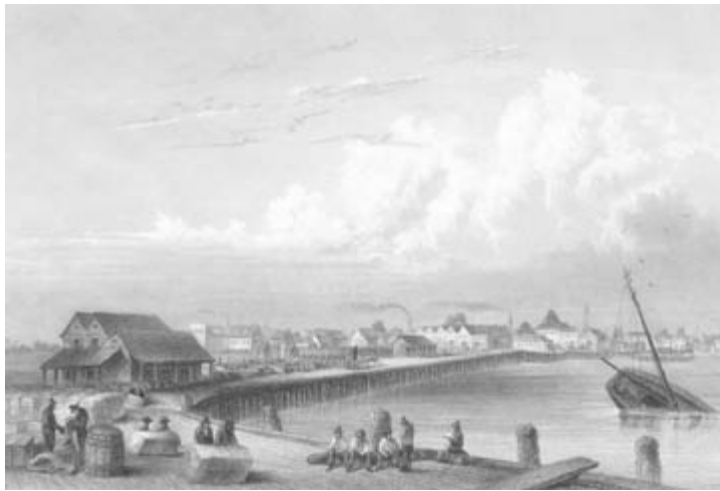
Graphic of Galveston, Texas, ca.1852.