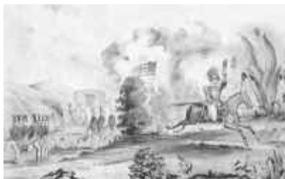
"Flight of Santa Anna from the Battle of Cerro Gordo,"