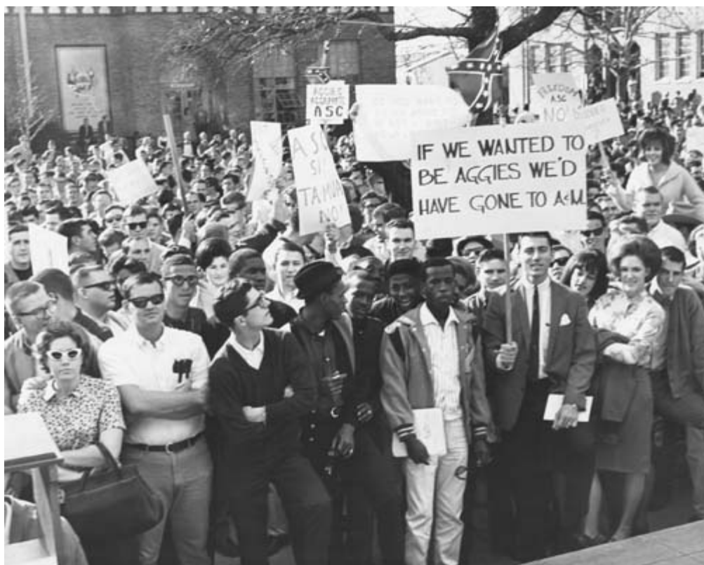
Arlington State College students protest the proposed renaming of the school by Texas A&M University, 1964.