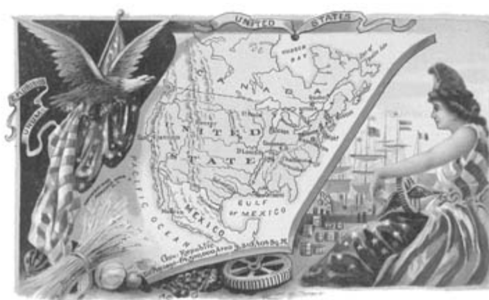
Map and graphic of North America from Arbuckle's Illustrated Atlas of Fifty Principal Nations of the World (New York, 1890).

Foreign and special focus atlases account for twenty-three percent of the acquisition. These atlases include European productions as well as titles published in the United States of a thematic nature, such as touring and road atlases, war atlases, and historical atlases. Special atlases in particular reflect the political and diplomatic trends of an era, such as the war atlases produced for World War I and World War II, as well as the dramatic changes brought about by the automobile. Of particular interest is an 1890 edition of Arbuckle's Illustrated Atlas of Fifty Principal Nations of the World , published in New York by Arbuckle Brothers. The atlas, unpagged and tied with cording, contains sheets with four chromolithographic views of different countries. The accompanying text is on the verso of the previous page. The edition is noted as an "early cigarette card-type coffee premium map series."