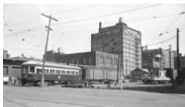
The 315 with trailer leaves Dallas on the Waco run, January 1, 1946.

817-272-3393 or email at spurr@uta.edu .