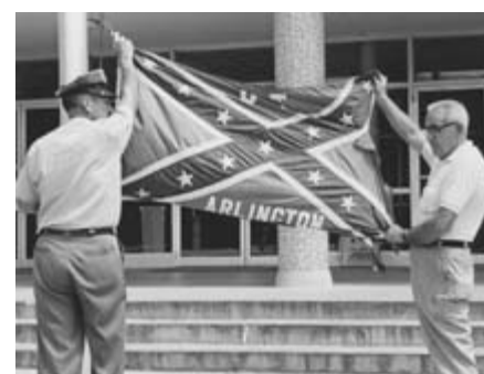
The flag of UTA, the Stars and Bars, was permanently removed from its pole in front of the student center, July 1968.