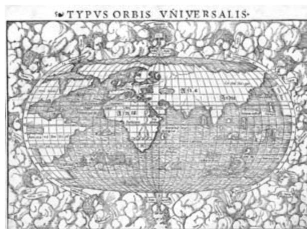
Sebastian Münster, Typus Orbis Universalis, ca.1550.