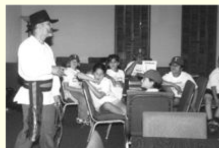
The Texas Rangers Program runs each summer for area fifth graders. Living history performers are always well received by the children.