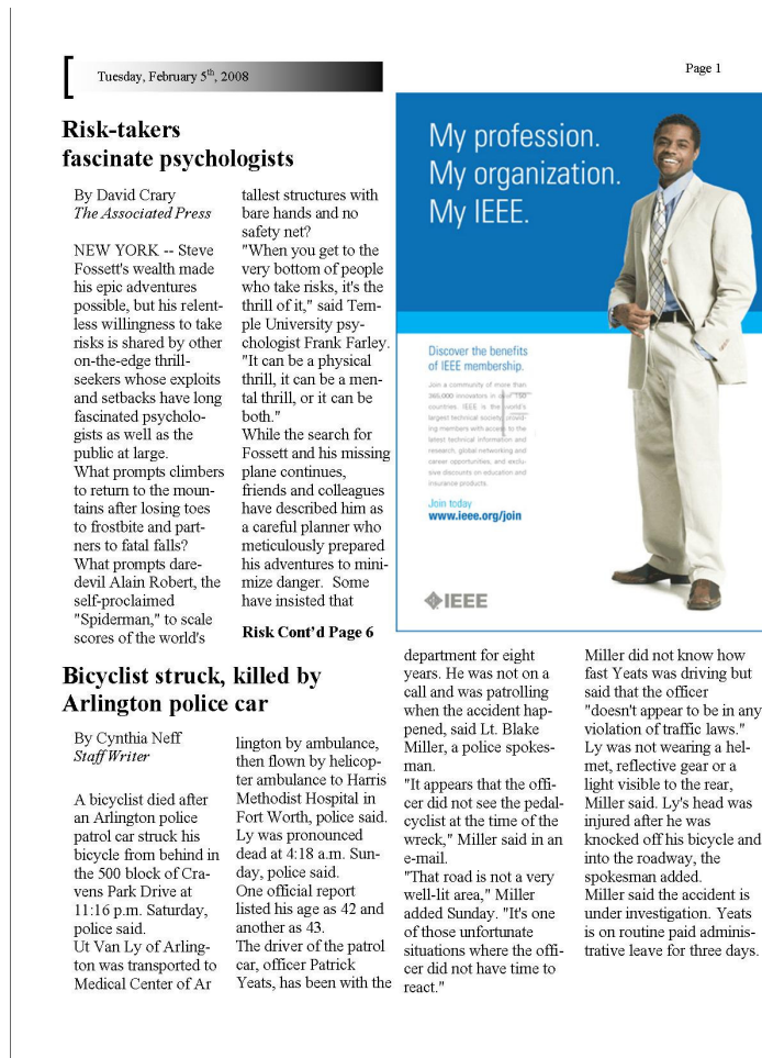
Figure 3.1 Newsletter Featuring African-American Model

The ultimate layout and design of the newsletter was intended so that participants would view the advertisement similarly to how print advertisements are viewed in real life, in the context of being surrounded by written copy as opposed to studying the advertisement directly as a stand alone document.